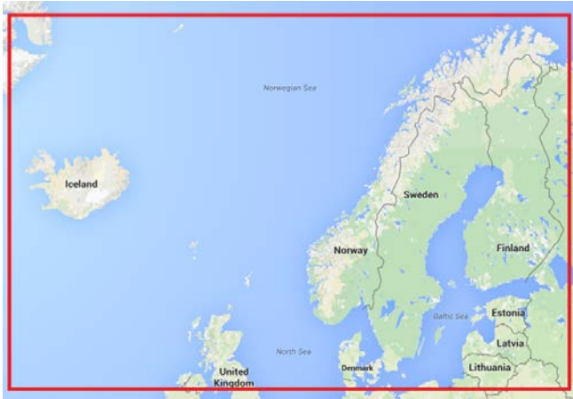
Figure 1: Area from within tweets with geographical coordinates were collected from the API.

The collection script selected only tweets with a populated place object that originated within a bounding box circumscribing the territorial boundaries of the Nordic countries (longitude -26 to 32, latitude 53 to 72; see Figure 1).