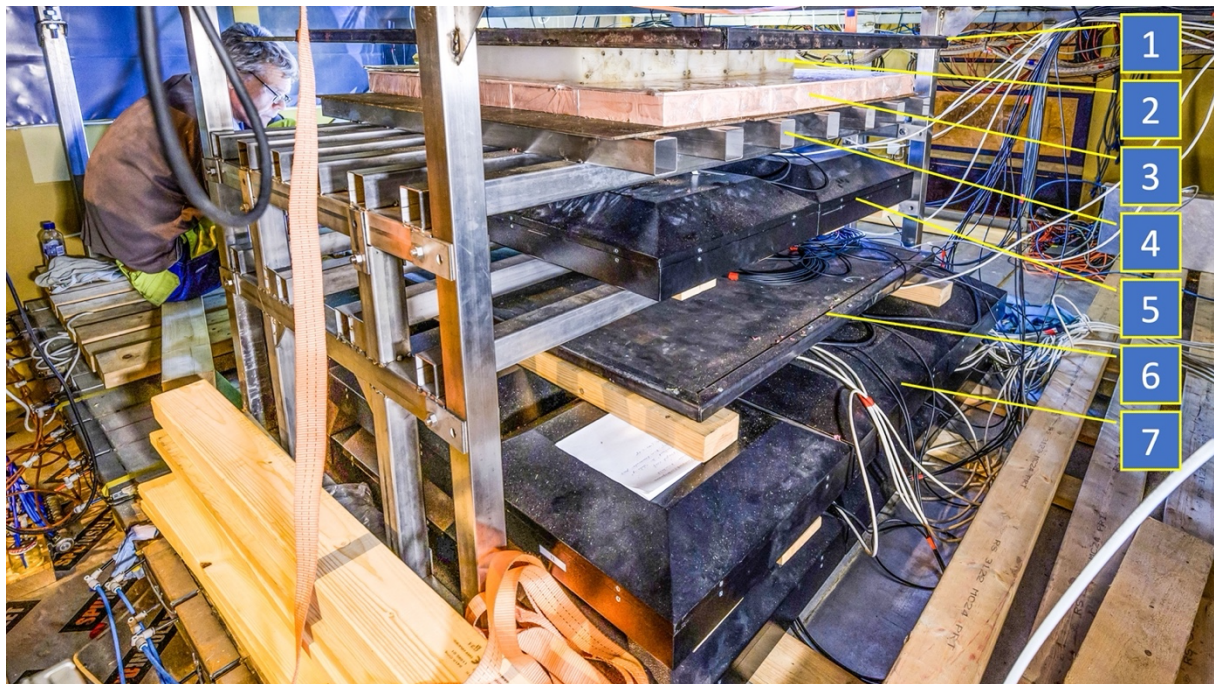
Figure 1. Photograph of the central section of the NEMESIS setup: (1) a large-area scintillator (a thin, black plate), (2) a set of white polyethylene (PE) moderator blocks with He-3 counters inside (not visible on the photo), (3) a 5 cm thick 1 \text{ m}^2 target consisting of 50 standard-size metallic bricks (Pb, Cu or none for the background measurement), (4) support structure, (5) four SC16 modules, (6) the second large-area scintillator, and (7) the two bottom layers of SC16 modules.

For WIMPs in the \text{GeV}/c^2 mass range, meaningful searches could also be conducted on a smaller scale. For instance, if a WIMP with a mass of a few \text{GeV}/c^2 self-annihilates on a Pb target, the emerging SM particles would trigger a chain of interactions resembling proton- or muon-induced spallation. In 2001-2002, a group of Russian and US scientists, motivated by the reports of high neutron multiplicity events observed in space radiation studies and high-energy spallation, searched for WIMP self-annihilation using Neutron Multiplicity Detector System (NMDS) [5]. NMDS consisted of a 300 kg cubical Pb target surrounded by sixty-four He-3 neutron detectors inside a moderator. The 271-day measurement, conducted at 583 m.w.e. depth, yielded no conclusive results. However, three minor anomalies were detected in the data.