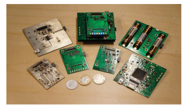
Figure 4. Example of hardware used in demo (left to right, top row: USB interface module, example of a build node structure shown in Figure 3, battery module; bottom row: sensor, LED and radio modules, main board).