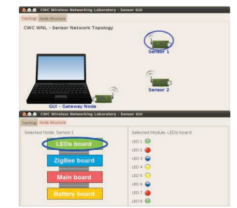
Figure 3. Example layouts of demo GUI for three nodes.

The major purpose of the demo is to present the platform and demonstrate its capabilities. We will show how the WSAN nodes featuring different functionalities (e.g., sink, sensor, actuator or dual-role) can be assembled from the hardware modules (see Figure 4). Once a node is powered, it will join the network and the GUI will display node's structure and start showing the data about node's modules. Then, the GUI can be used to give commands and change operation of particular modules (e.g., power on/off the peripherals or change their operation mode). The information about network topology will be shown as well, but for demo purposes we will limit the network to only 4-6 nodes located within direct communication range of sink.