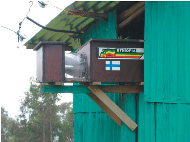
Fig. 1. The Photometer operating at EFO (Ethio-Finno Observatory) at the top of Entoto Mountain in Ethiopia.