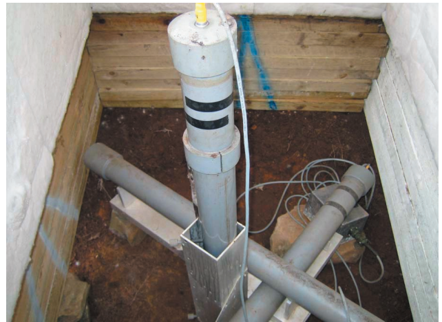
Fig. 2. The pulsation magnetometer operating at EFO (Ethio-Finno Observatory) at the top of Entoto Mountain in Ethiopia.

These instruments make measurements on a regular basis and the data are recorded automatically with the acquisition system shown in Figure 3. An example of an analysis of data from the pulsation magnetometer is shown in Figure 4.